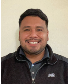
CALIFORNIA STATE UNIVERSITY, EAST BAY MAJOR: CONSTRUCTION MANAGEMENT

I was born in La Estancia Del Refugio, Guanajuato, Mexico. It is a small town where everyone knows each other, and it is full of culture and tradition. At the age of 7, my parents decided to migrate to the United States in pursuit of the American dream, a decision that shaped my future and changed my life for the better. This decision also brought me to the Bay Area, more specifically San Jose, California, where I spent the rest of my childhood and currently still reside.