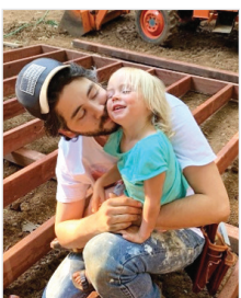
CALIFORNIA STATE UNIVERSITY, CHICO MAJOR: CONSTRUCTION MANAGEMENT

I was born and raised in Chico, California. My family has lived in the area since the 1850s. I have moved away a few times, but the beauty of Upper Park has always brought me back. My mom was a track and field coach as well as a basketball coach at the local high school, so most of my childhood was spent in a gym or at a track. This experience showed me that hard work pays off. I took this focus and applied it to my career and education. The opportunity to study at Chico State in my hometown has been a privilege. Chico will always be my home, but I am excited to see what the future holds.