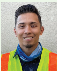
CALIFORNIA STATE UNIVERSITY, EAST BAY MAJOR: CONSTRUCTION MANAGEMENT

I grew up in Ceres, California, a small town located next to Modesto in Stanislaus County. Growing up, I didn't have much, but I did have parents who showed me the value of hard work and what dedication is. As a young teenager, I saw my mom get laid off and watched my dad carry the weight of the family on his shoulders. Watching him relocate to work in the Bay Area in Oakland when I was 14 was tough to experience. Knowing the sacrifice he would have to make in terms of losing precious time with us, his family, was difficult for him, but he wanted to give us the best life possible.