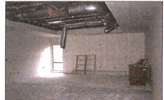
Renovations are taking place on the interior of the new WACA building. Shown here are before and after of the conference room at the new location on Sonoma Drive in Pleasanton.

Based on its geographical reach, WACA felt that Pleasanton was a good central location for the association and its members; and moved the